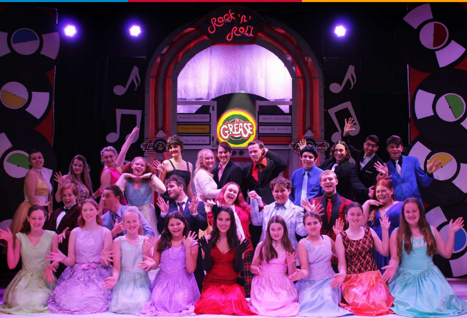
A glimpse of Grease production with students and staff together onstage and off set. Audiences were amazed by the creative talent and set design. We even made the local paper....twice!