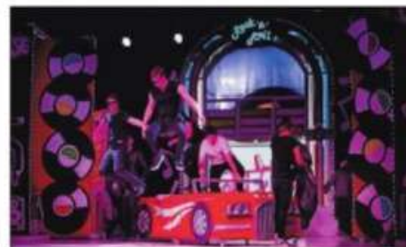
SUMMER LOVIN: The cast has perfected their facial expressions, the way they talk and walk and classic songs including Greased Lightnin' .