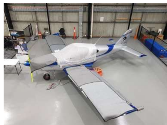
Students got to check out Aeronautical Engineering at University of Newcastle during recent visit.