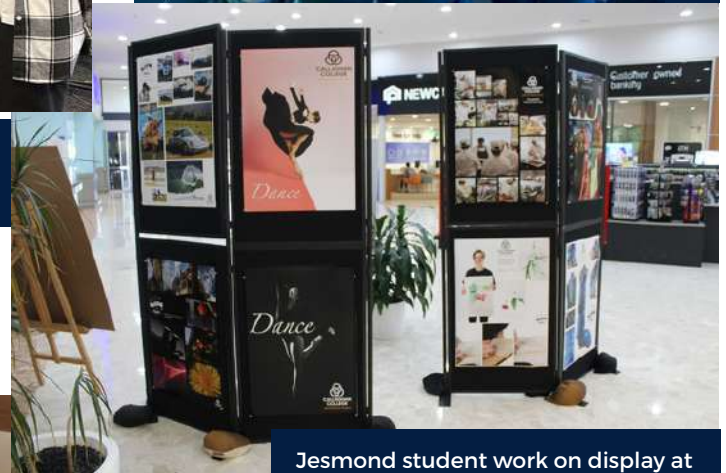
Jesmond student work on display at Jessmond Shopping Centre