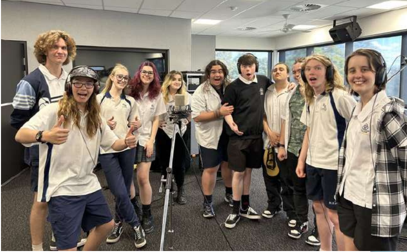
Music and Music Industry students are collaborating with Hunter River High students