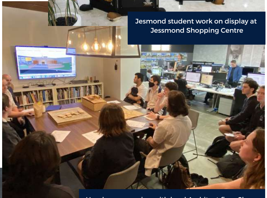
Hands on excursion with local Architect firm, Shaq. Below: Preparing for 2023 HSC conference