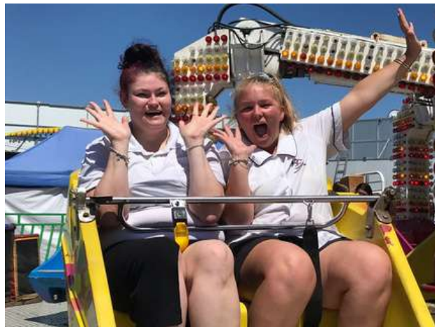
Students enjoying Newcastle Show