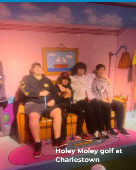
Holey Moley golf at Charlestown